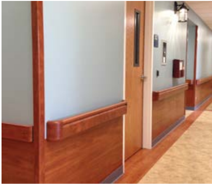
Wall Protection: Korowood™ handrail, corner guard and sheet goods