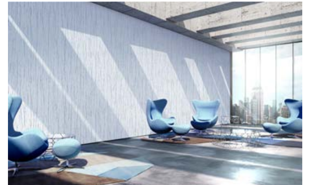
Designer Wallcovering: Arte® for Koroseal