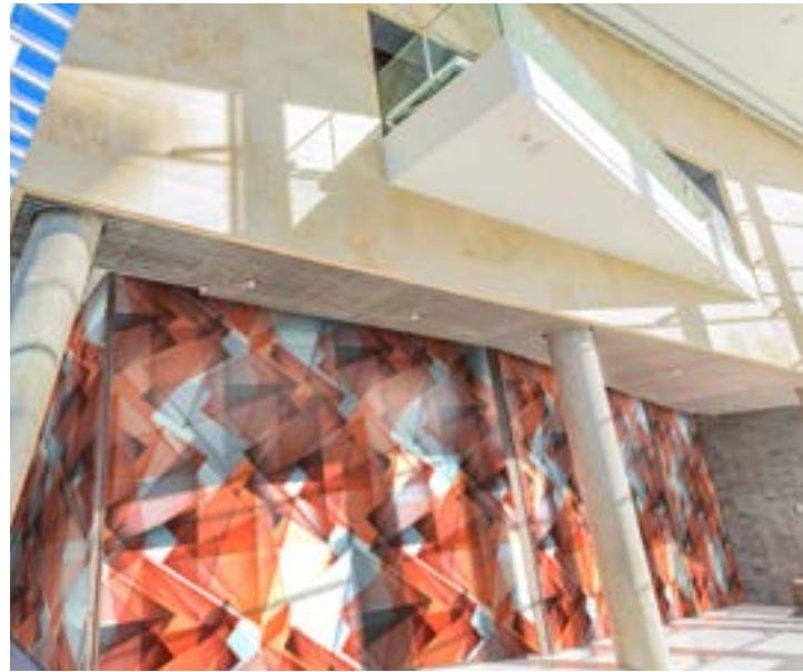
Wall Protection + Digital Lab: Fusion Digital Wall Protection