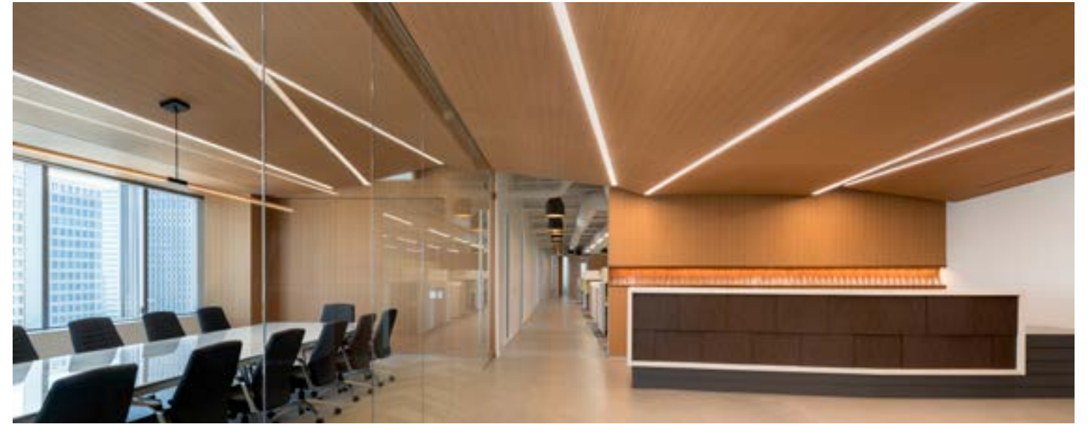
Specialty: Arbor™ Wood Wallcoverings