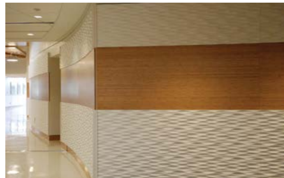
Specialty: Bellagard™ Sculpted Wall Panels