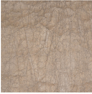
TAK-BA01 Series (2 colorways)

PATTERNS: TAK-BA01, TAK-BB01, and TAK-BB02 Series