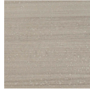
TAK-BB02 Series (2 colorways)