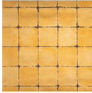
TAK-AA04 Series (2 colorways)