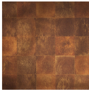
TAK-AA07 Series (2 colorways)