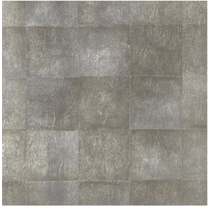
TAK-AA01 Series (2 colorways)

PATTERNS: TAK-AA01, TAK-AA04, TAK-AA05, TAK-AA06, TAK-AA07, and TAK-AA08 Series