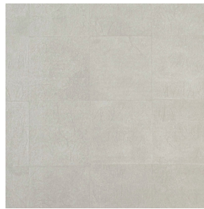
TAK-AA08 Series (2 colorways)