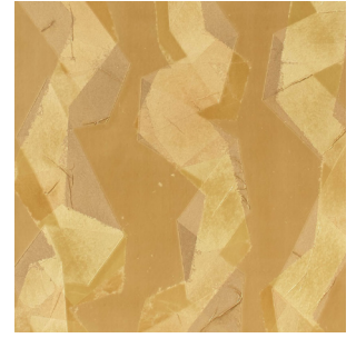
TAK-AA06 Series (3 colorways)