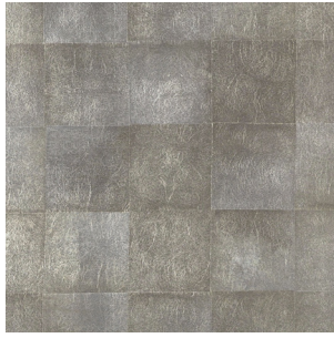
TAK-AA01 Series (2 colorways)

PATTERNS: TAK-AA01, TAK-AA04, TAK-AA05, TAK-AA06, TAK-AA07, and TAK-AA08 Series