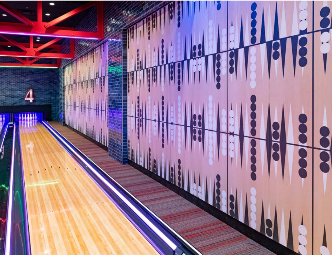
DIGITALLY PRINTED ARBOR® WOOD WRAPPED ACOUSTICAL PANELS

Our products are designed to withstand high-traffic and the ongoing needs of entertainment venues.