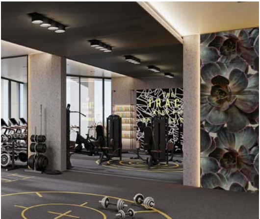
DIGITALLY PRINTED WALLCOVERING WRAPPED ACOUSTICAL PANELS