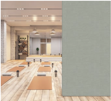
FLEX TYPE III WALLCOVERING

With high-quality materials that are built to resist moisture, our products ensure a sanitary, hygienic space that withstands customer use day in and day out.