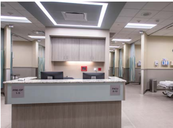
TRAFFIC PATTERNS® & REATEC®