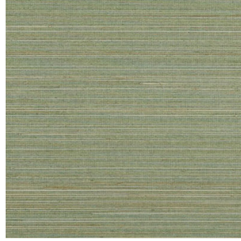
TAK-EA02 Series (4 colorways)