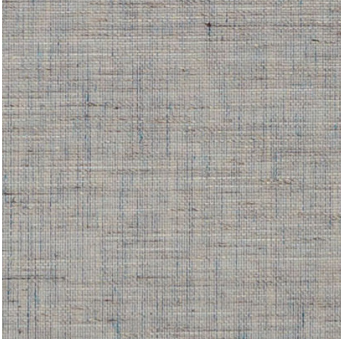
TAK-EA01 Series (5 colorways)

PATTERNS: TAK-EA01 through TAK-EA04 Series