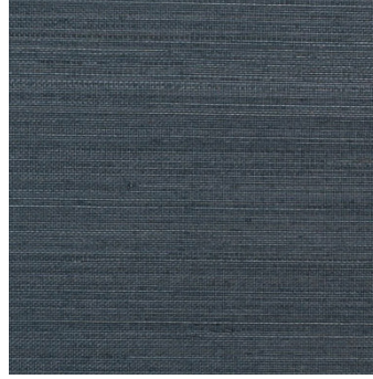
TAK-EA03 Series (3 colorways)